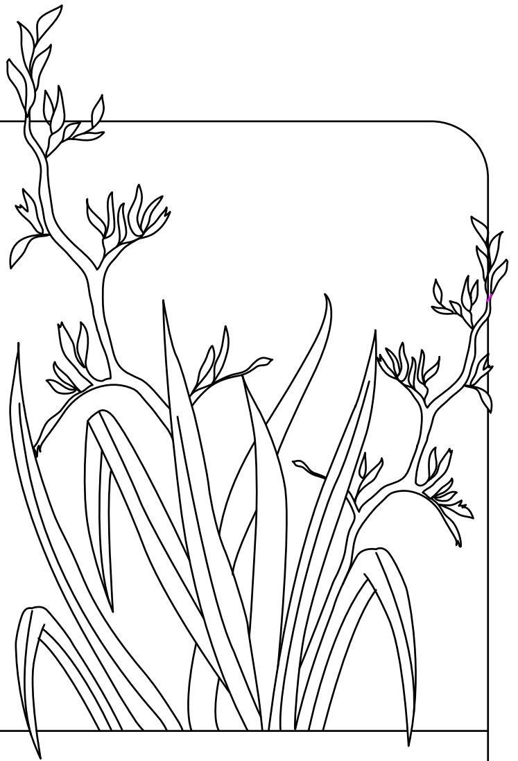
Illustration by Kahu Creative