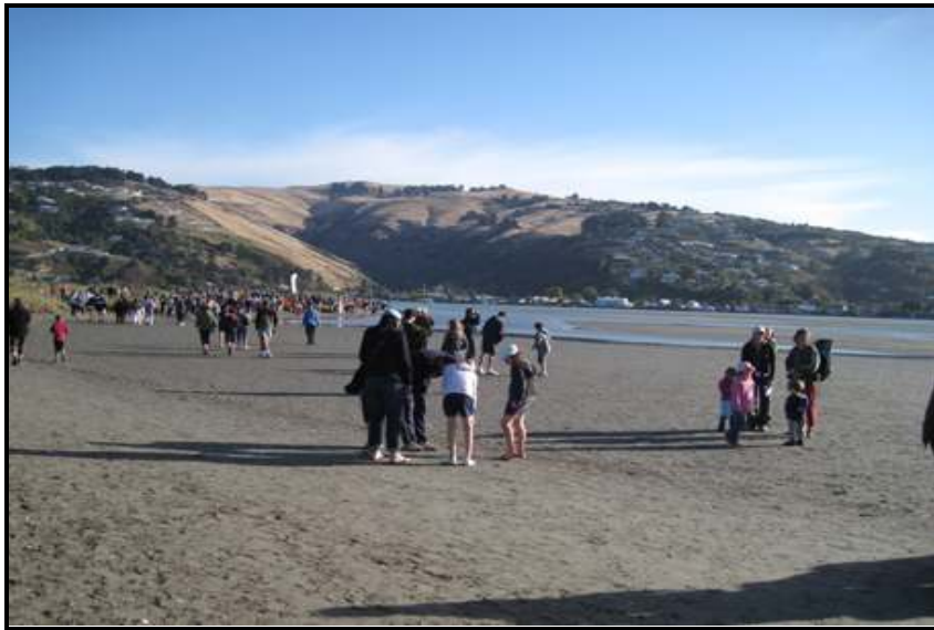
Farewell to the Godwits 2010 – a popular Christchurch event.

Over the summer of 2006 and 2007 Rob Greenaway completed a survey of recreational users of the Estuary. His research showed that the most popular recreation activities at the Estuary during this period were walking, dog walking, cycling, wind/kite surfing and sailing respectively. 183 South New Brighton Domain, Tidal View and the Windsurf Reserve off Humphreys Drive were the most popular entry sites to the Estuary. Seventy per cent of respondents had had some kind of interaction with other visitors to the Estuary – of these interactions, 91% were positive. The main reasons users stated for experiencing dissatisfaction with the Estuary area were rubbish/litter and poor water quality. 184 It is clear that by the beginning of the twenty first century, environmental issues surrounding the Estuary were impacting on recreational use of the area.